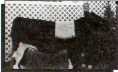
GRAND CHAMPION BEEF STEER

SINCERE APPRECIATION AND WARM THANKS TO OUR 2008 BUYERS