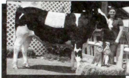
GRAND CHAMPION DAIRY STEER

RESERVE CHAMPION BEEF STEER Purchased by CLOTHES CLINIC Shown by Hunter Flanders