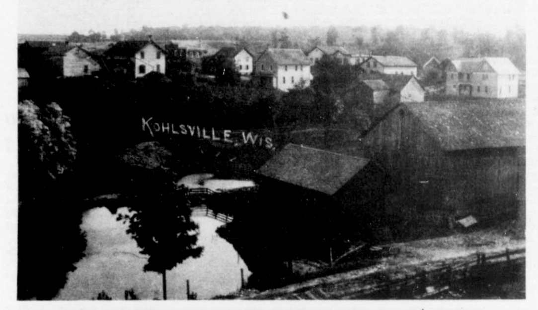
The "good old days" in Kohlsville. This photo was taken around 1907. We welcome your old pictures.