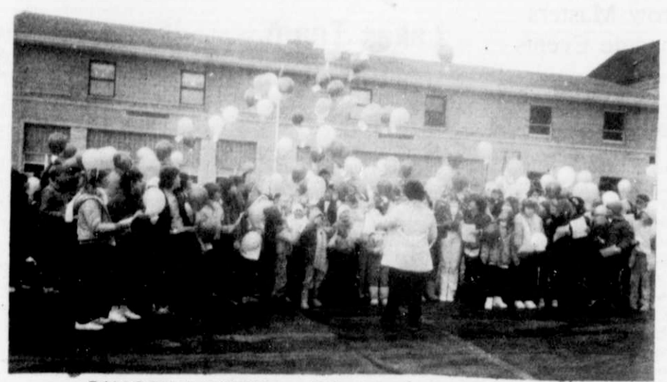
BALLOON LAUNCH - Holy Trinity Catholic School, Kewaskum, recently opened Catholic Schools Week festivities with a Balloon Launch. Shown in the above photo are the students releasing their balloons as they sang, "Up, Up and Away." Each balloon had the student's name and address attached. According to a response, one balloon traveled as far as Pennsylvania