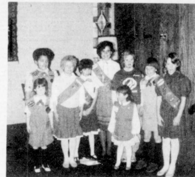
Greeting the parishioners at Peace Church.