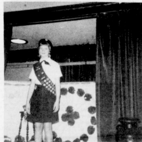
Style Show - 1973