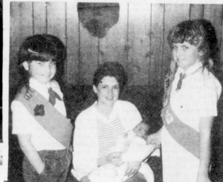
First baby girl born during Girl Scout Week