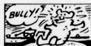
The teddy bear was named for Theodore Roosevelt.