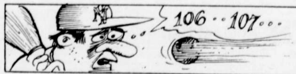
There are 108 stitches on a regulation baseball.