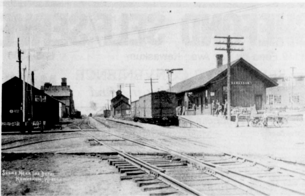
The Kewaskum railroad depot was built in 1876 to provide for the safety and comfort of train passengers. The structure, which was built at a total cost of $4,003, was torn down in 1967. Check your family albums for old photos and bring them to the Statesman. Your picture will be returned.