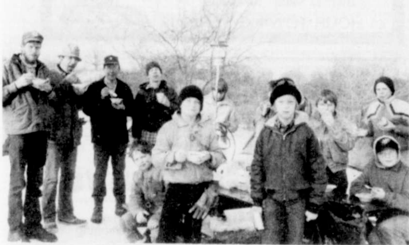
The scouts eat a hot breakfast after the long, cold night.