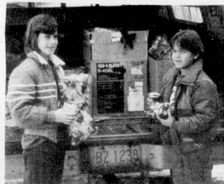
Collected food for needy families at Christmas - 1986