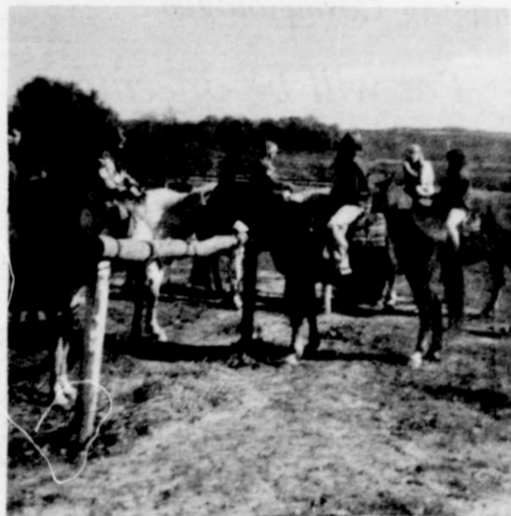
Horseback riding - 1970