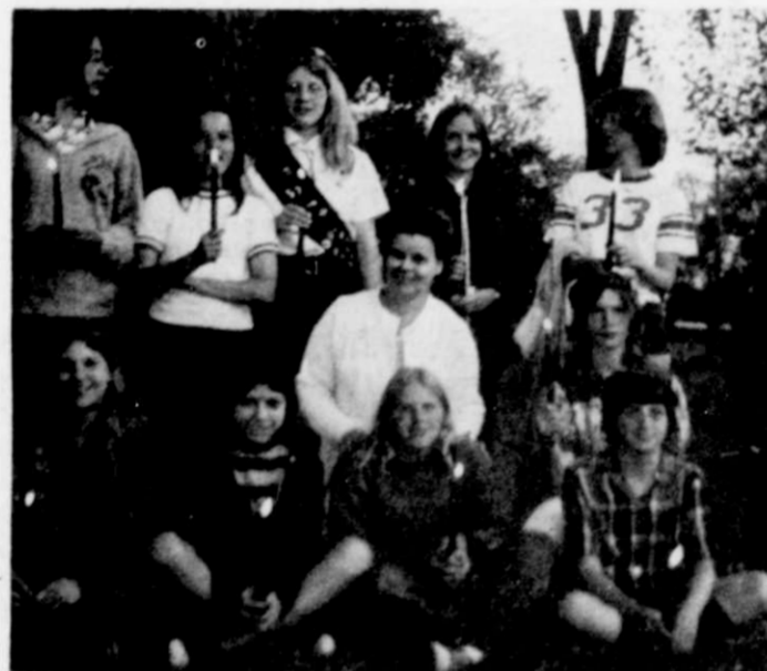
Capping - First senior troop in Kewaskum - 1974