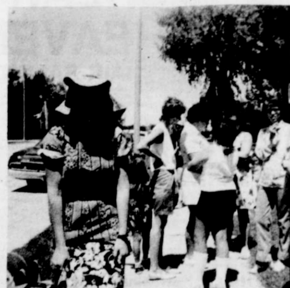
Camping - Summer fun - 1972