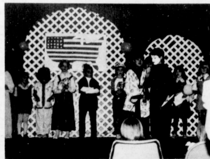
Performing at folk fair - 1986