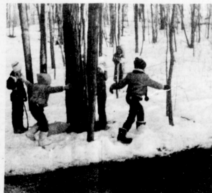
A trip to Riveredge at Maple Syrup time - 1985