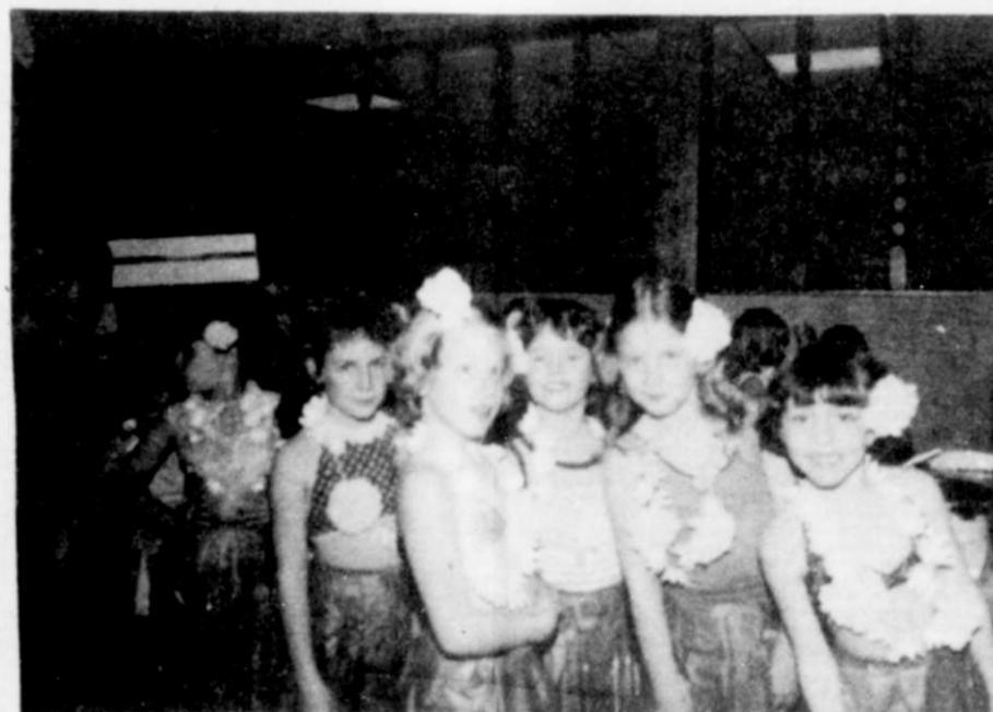
Performing at brunch - 1980