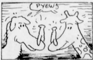
Both the giraffe and the camel can close their nostrils at will.