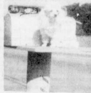
This white poodle is looking for a nice home. For more information contact PUPPYLAND - 334-4640