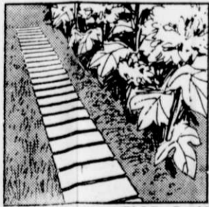
(U.S. Pat. Pend.)