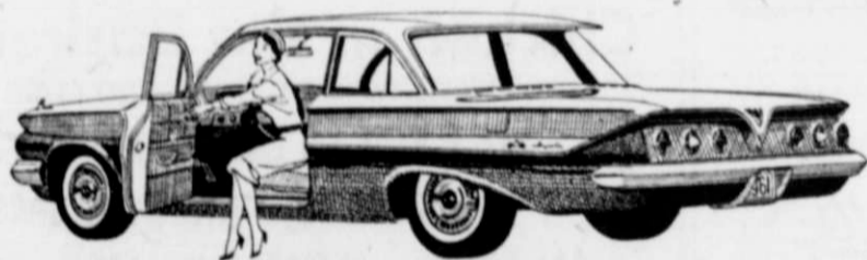
New '61 Chevrolet IMPALA 2-DOOR SEDAN

There are six easier loading Chevrolet wagons for '61—ranging from budget-pleasing Brookwoods to luxurious Nomads. Each has a cave-sized cargo opening measuring almost five feet across and a concealed compartment for stowing valuables (with an optional extra-cost lock).