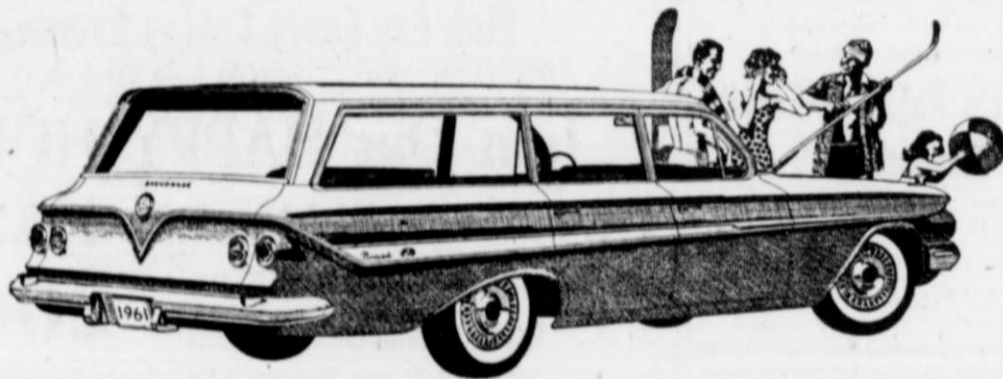
New '61 Chevrolet NOMAD 9-PASSENGER STATION WAGON

There are six easier loading Chevrolet wagons for '61—ranging from budget-pleasing Brookwoods to luxurious Nomads. Each has a cave-sized cargo opening measuring almost five feet across and a concealed compartment for stowing valuables (with an optional extra-cost lock).