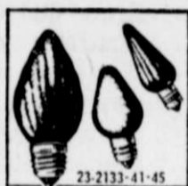
G.E. Tree Bulbs 9¢ ea.

Here's fun for the whole family! Ten 11" plastic pins, two 5" balls, pin-spottler.