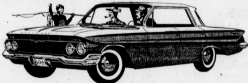
New '61 Chevrolet BEL AIR SPORT SEDAN

There's a whole crew of new Chevy Corvairs for '61—polished and perfected to bring you spunk, space and savings. Lower priced sedans and coupes offer nearly 12% more room under the hood for your luggage—and you can also choose from four new family-lovin' wagons.