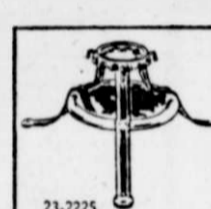
Supreme Stand 1 98

Complete set with "heat-up" iron! Pad, cover, "mesh-top" board, too. 22" high.