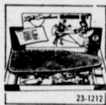
Ironing Set 3 77

Assorted colors. Type C-6, 15-volt lamps. C-7 1/2 type... ea. 15¢ C-9 1/2 type... ea. 20¢