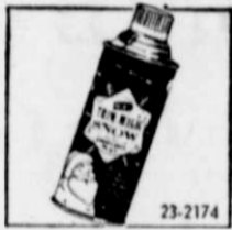
Snow Spray 79¢

VISIT GAMBLES TOYLAND WHILE SELECTIONS ARE COMPLETE (As Little as 50¢ Holds on Lay-Away!)