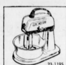
Food Mixer 88¢

Steel stand has 4 adjusting screws, holds trees 3 1/2" W. Non-tip legs. Red, green.