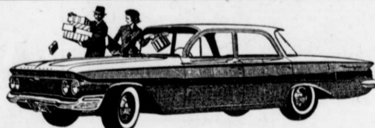
New '61 Chevrolet 4-DOOR BISCAYNE 6

Beautiful Bel Airs, priced just above the thriftiest full-size Chevies, bring you newness you can use: larger door openings, higher easy-chair seats, more leg room in front, more foot room in the rear, all wrapped up in parkable new outside dimensions.