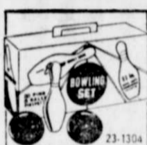
Deluxe Bowling 2 99

Spray your tree, mirrors or windows. It's safe, wipes off easily. Large 13-oz. can.