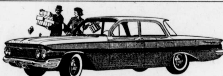
New '61 Chevrolet 4-DOOR BISCAYNE 6

Beautiful Bel Airs, priced just above the thriftiest full-size Chevies, bring you newness you can use: larger door openings, higher easy-chair seats, more leg room in front, more foot room in the rear, all wrapped up in parkable new outside dimensions.