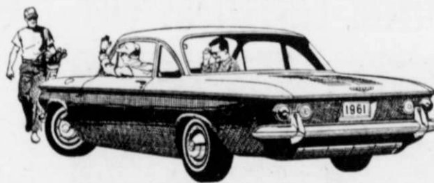
New lower priced '61 CORVAIR 700 CLUB COUPE

Here's a new measure of elegance from the most elegant Chevrolets of all. There's a full line of five Impalas—each with sensible new dimensions right back to an easier-to-pack trunk that loads down at bumper level and lets you pile baggage 15% higher.