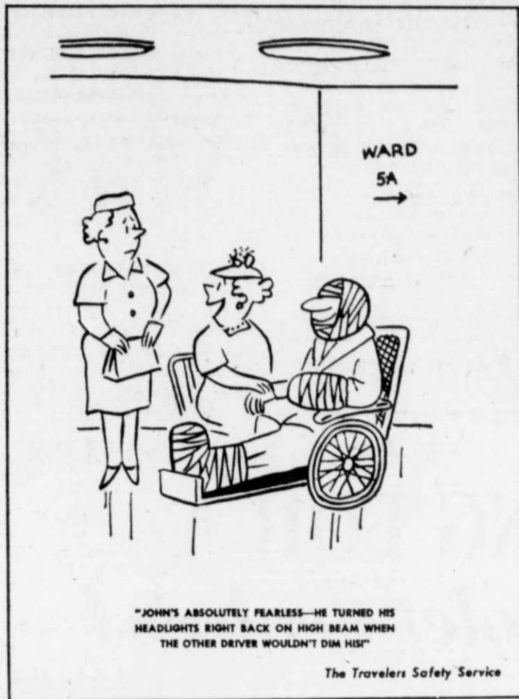
Bad manners on the highway helped to kill 37,600 persons in 1959.