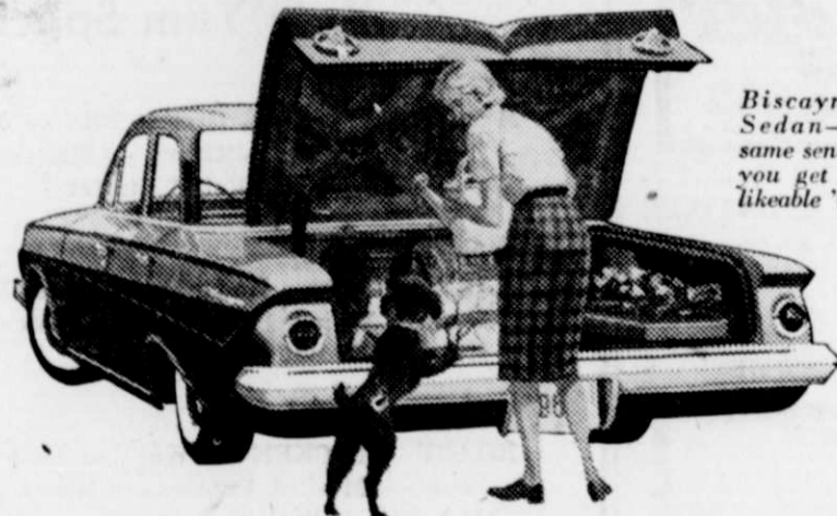
Biscayne 4-Door Sedan—with the same sensible design, you get in all the likeable '61 Chevies.

★ For big-car comfort at small-car prices ★ ★ '61 CHEVY BISCAYNE 6 ★ ★ The lowest priced full-sized Chevy! ★ Biscaynes—6 or V8—give you a full measure of Chevrolet quality—yet they're priced down with many cars that give you a lot less! ★