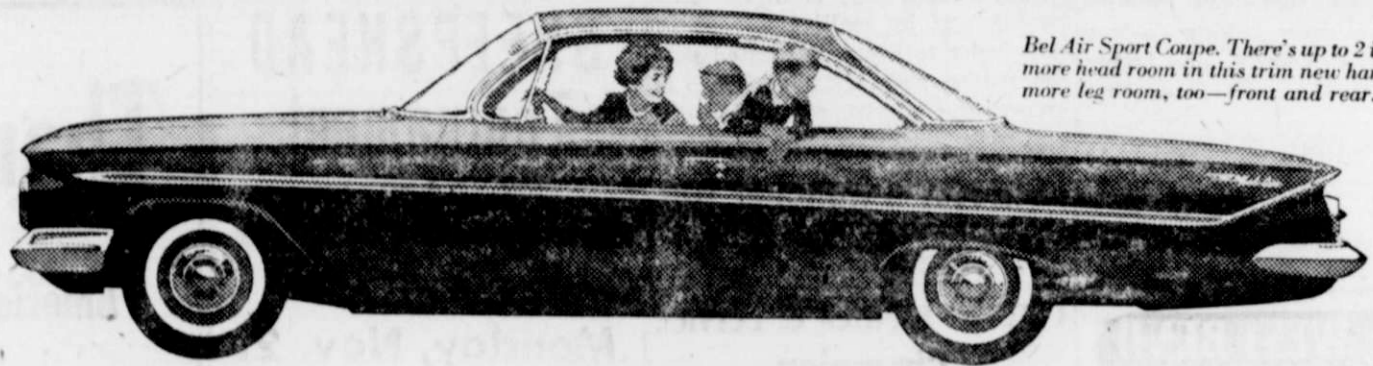
Bel Air Sport Coupe. There's up to 2 inches more head room in this trim new hardtop; more leg room, too—front and rear.