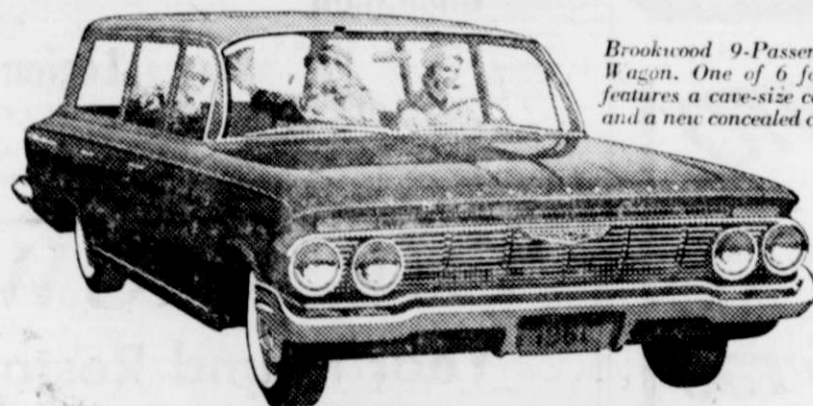
Brookwood 9-Passenger Station Wagon. One of 6 for '61. Each features a cave-size cargo opening and a new concealed compartment.