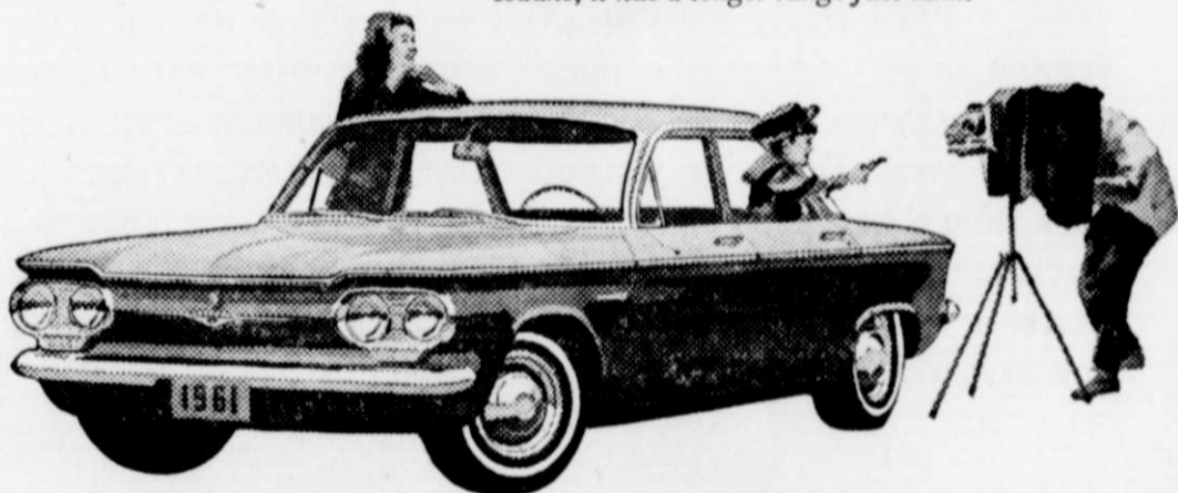
CORVAIR 700 4-DOOR SEDAN. Provisions for heating ducts are built right into its Body by Fisher.