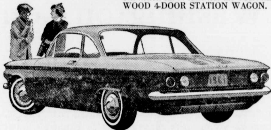
CORVAIR 700 CLUB COUPE. Like all coupes and sedans, it has a longer range fuel tank.