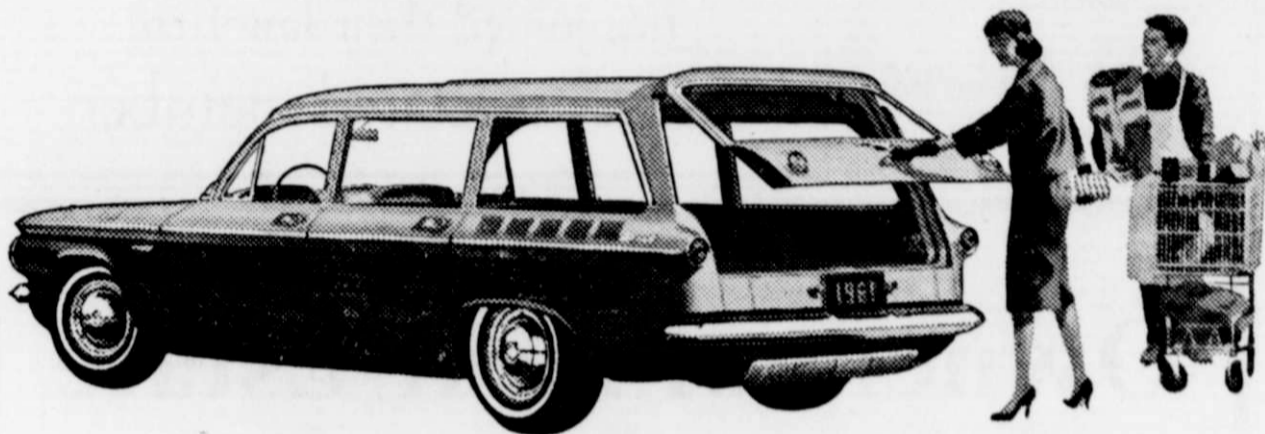
The newest car in America: the CORVAIR 700 LAKEWOOD 4-DOOR STATION WAGON.