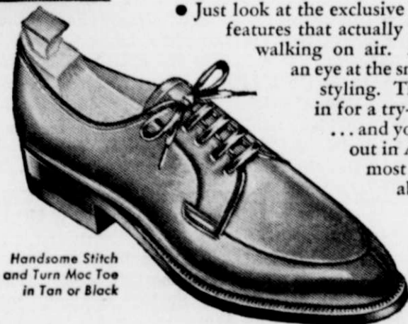
Handsome Stitch and Turn Moc Toe in Tan or Black