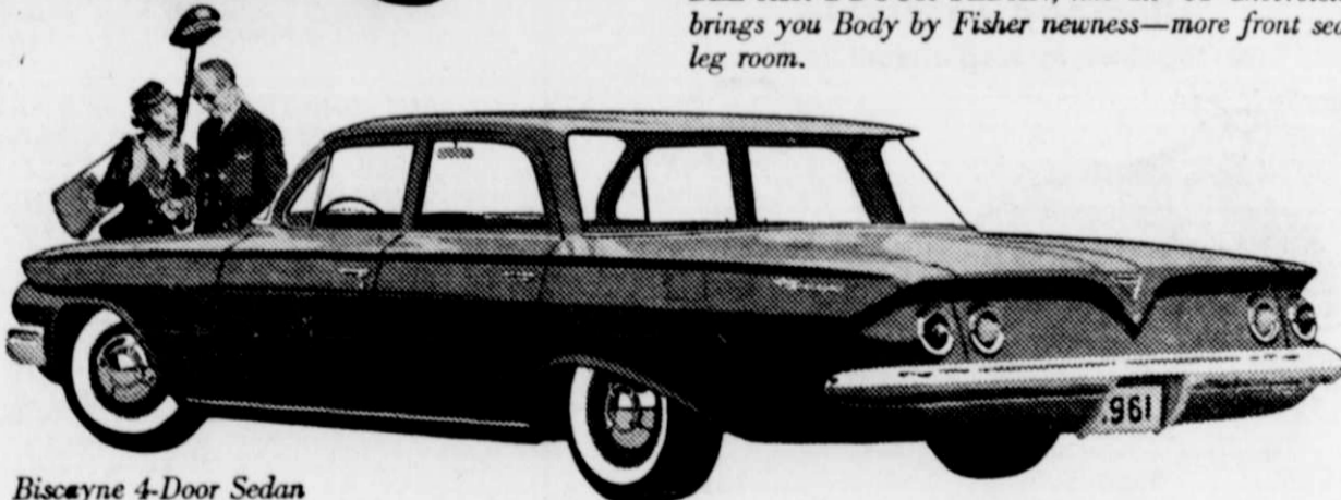
Biscayne 4-Door Sedan

See the new Chevrolet cars, Chevy Corvairs and the new Corvette at your local authorized Chevrolet dealer's