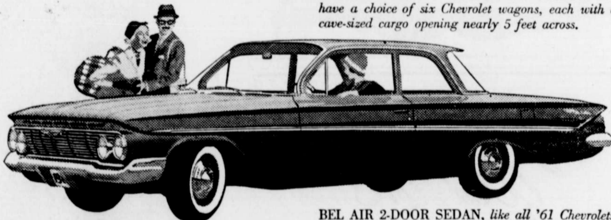
BEL AIR 2-DOOR SEDAN, like all '61 Chevrolets, brings you Body by Fisher newness—more front seat leg room.