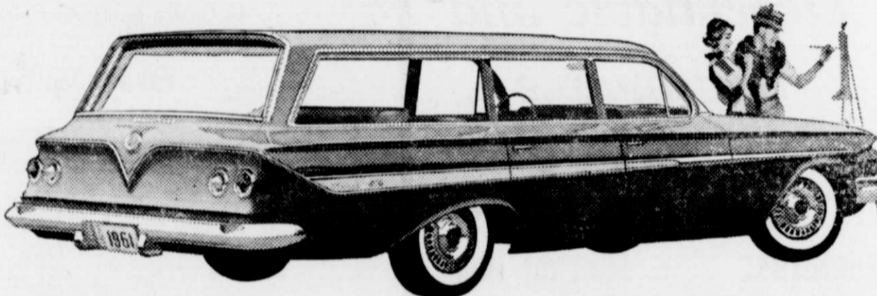
NOMAD 9-PASSENGER STATION WAGON. You have a choice of six Chevrolet wagons, each with a cave-sized cargo opening nearly 5 feet across.