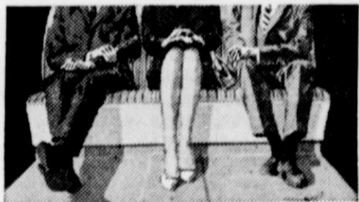
Even middle-seat passengers sit pretty, thanks to Corvair's practically flat floor.