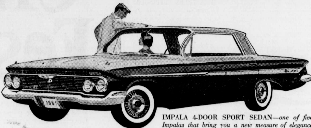
IMPALA 4-DOOR SPORT SEDAN—one of five Impalas that bring you a new measure of elegance from the most elegant Chevis of all.

Chevy's new '61 Biscaynes—6 or V8—give you a full measure of Chevrolet quality, roominess and proved performance—yet they're priced down with many cars that give you a lot less! Now you can have economy and comfort, too!