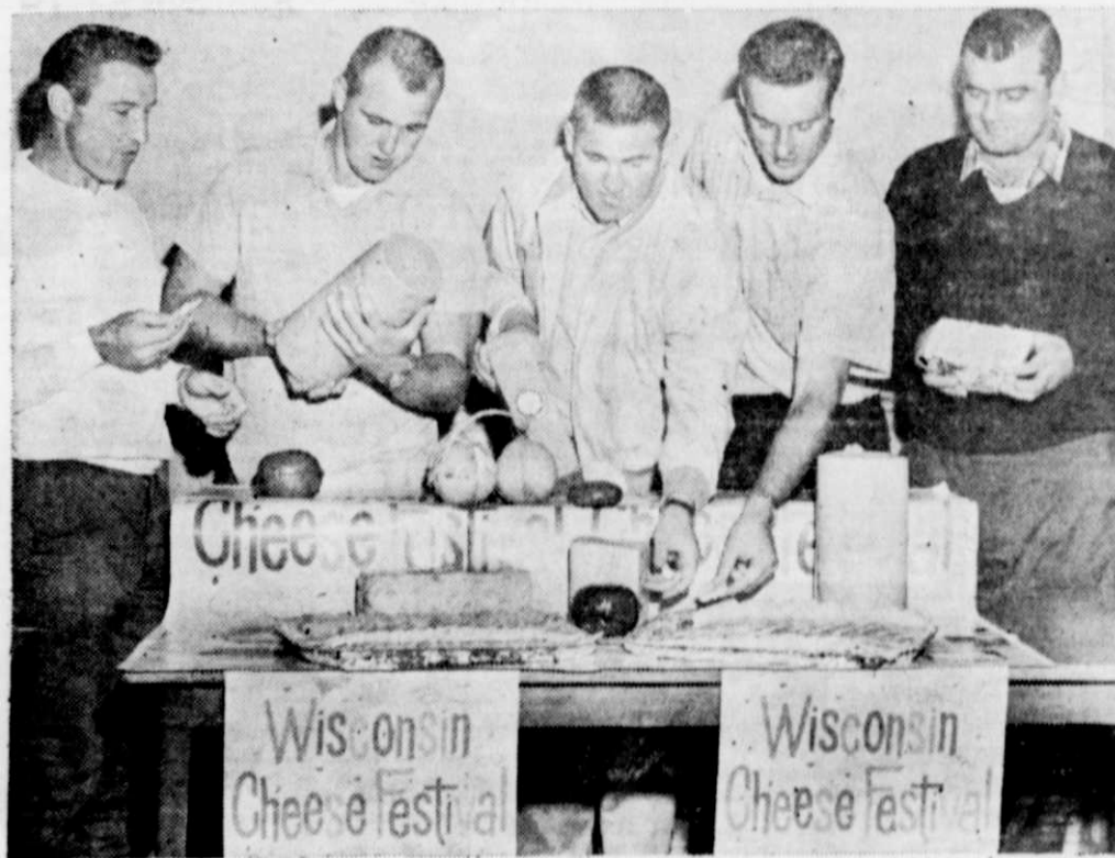
Athletes love good Wisconsin cheese. Watch the Packers above charge into that line-up of cheese treats. Cheese is a regular item at the Packers' training tables.