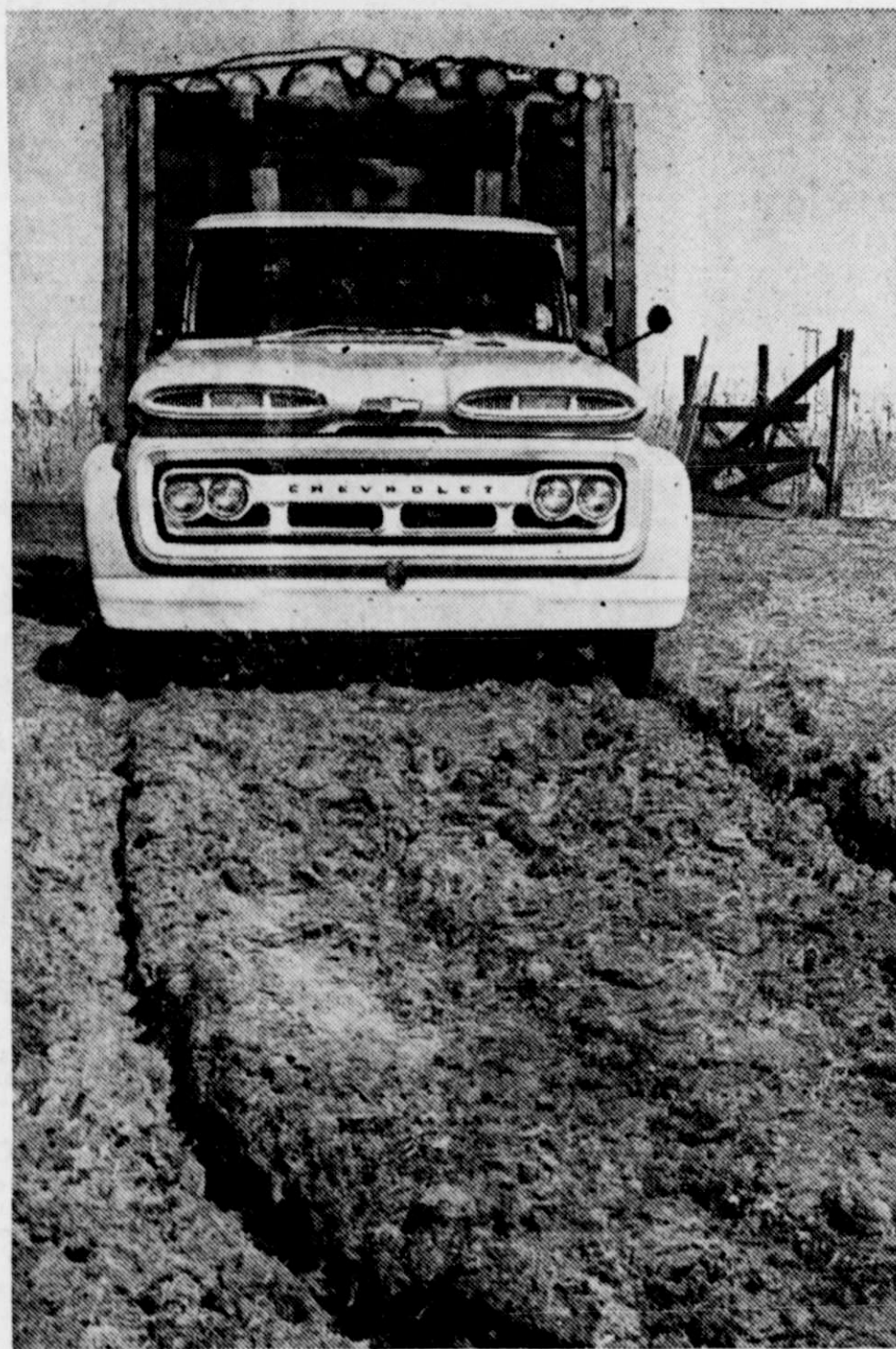
See the Chevy Mystery Show in color Sundays, NBC-TV

"These trails would shake the cab off an ordinary truck...but not our Chevy"