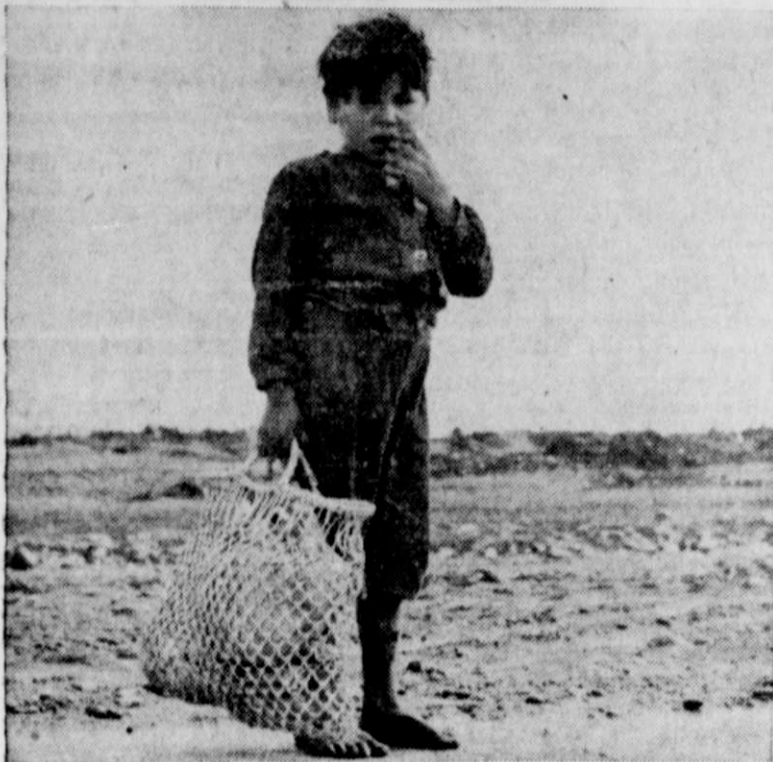
Dramatic proof of the need for aid for Chilean earthquake victims is evidenced by this Puerto Montt orphan—his only belongings heaped in a string bag—shown waiting a mercy plane trip to a refugee reception center in Santiago.

Nations throughout the world are responding to appeals for help. President Eisenhower appointed American Red Cross President, General Alfred M. Gruenther, as coordinator of U. S. voluntary relief efforts. Numerous religious and welfare organizations are engaged in the massive relief project. The Red Cross, which is conducting a nationwide fund appeal, made an initial allocation of $175,000 and provided $250,000 worth of donated medical and other supplies.