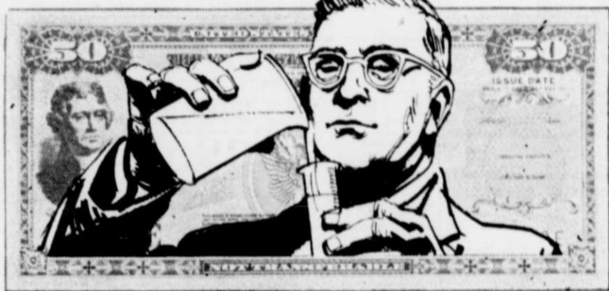
Money to let our scientists continue their search for answers. . . .