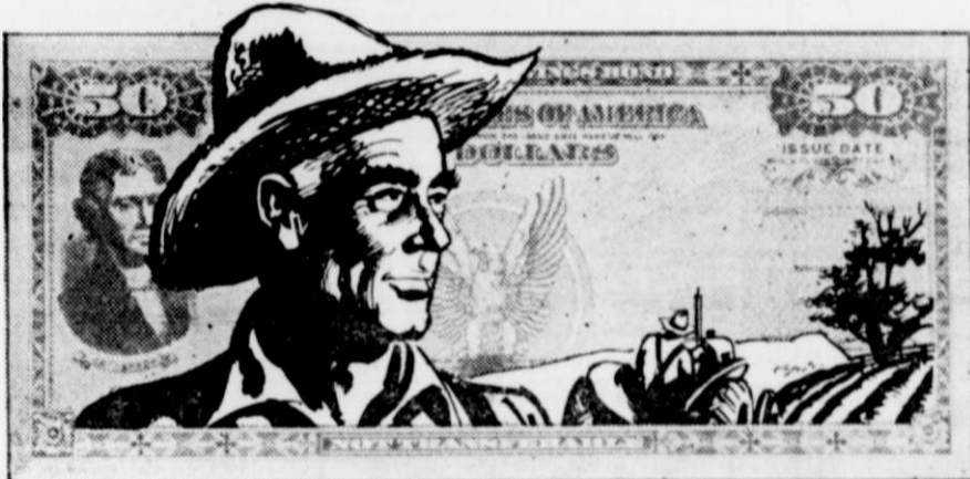
Money to insure that our productive power will thrive. . . .