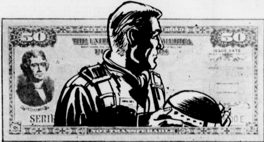
It takes money to keep our jet pilots patrolling the skies. . . .