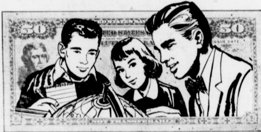
Money to help our children learn how to make peace lasting.

Yes, peace costs money. Money for research and schools and military preparedness. Money saved by you to keep our economy strong.