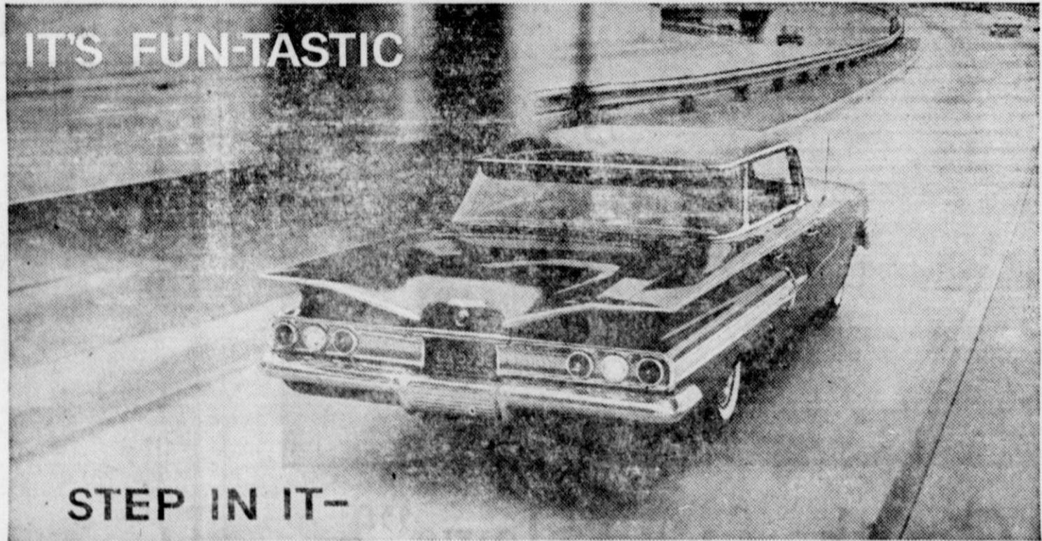
Impala Sport Sedan