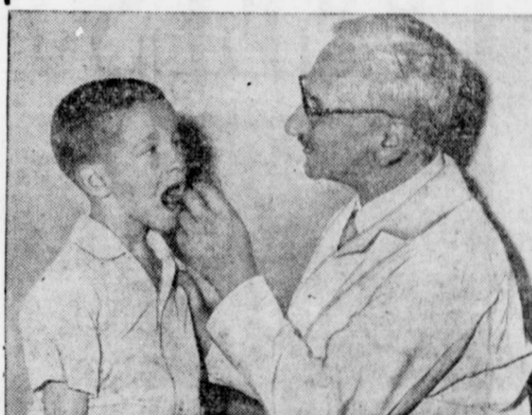
IN CINCINNATI, Dr. Albert Sabin has developed a live virus oral vaccine with March of Dimes funds. When ultimately available for general use the live virus vaccine may make protection against paralytic polio easier, cheaper and even more effective than that of the Salk vaccine. Other health targets in the New March of Dimes campaign for January 1960 are birth defects and arthritis.