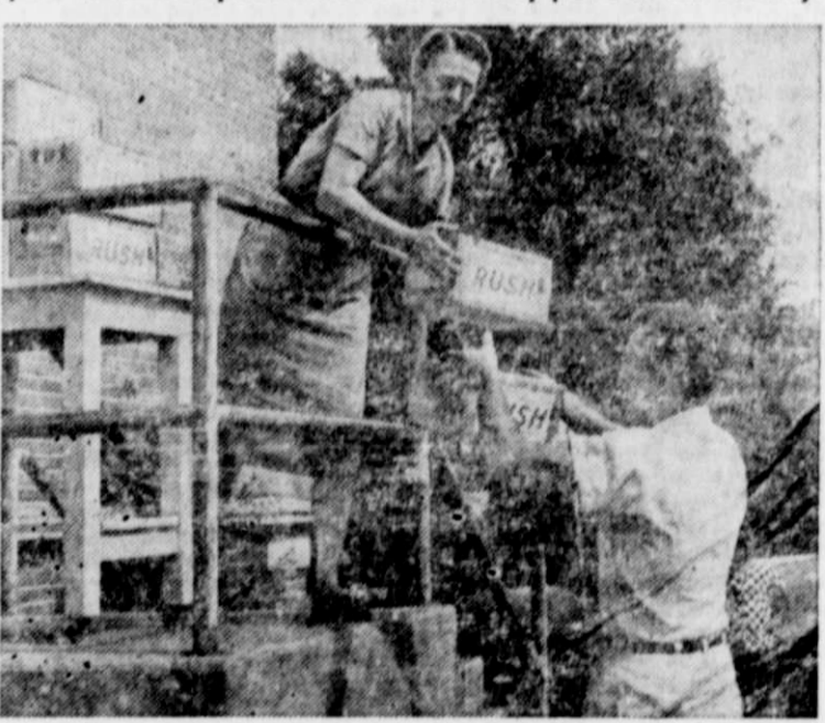
IN KANSAS CITY, hit by a mid-summer polio epidemic, Salk vaccine was rushed to inoculation centers. Outbreaks also occurred during 1959 in Des Moines, Little Rock, New Haven and Montreal. In 1959 paralytic polio cases rose by more than a third over 1958.