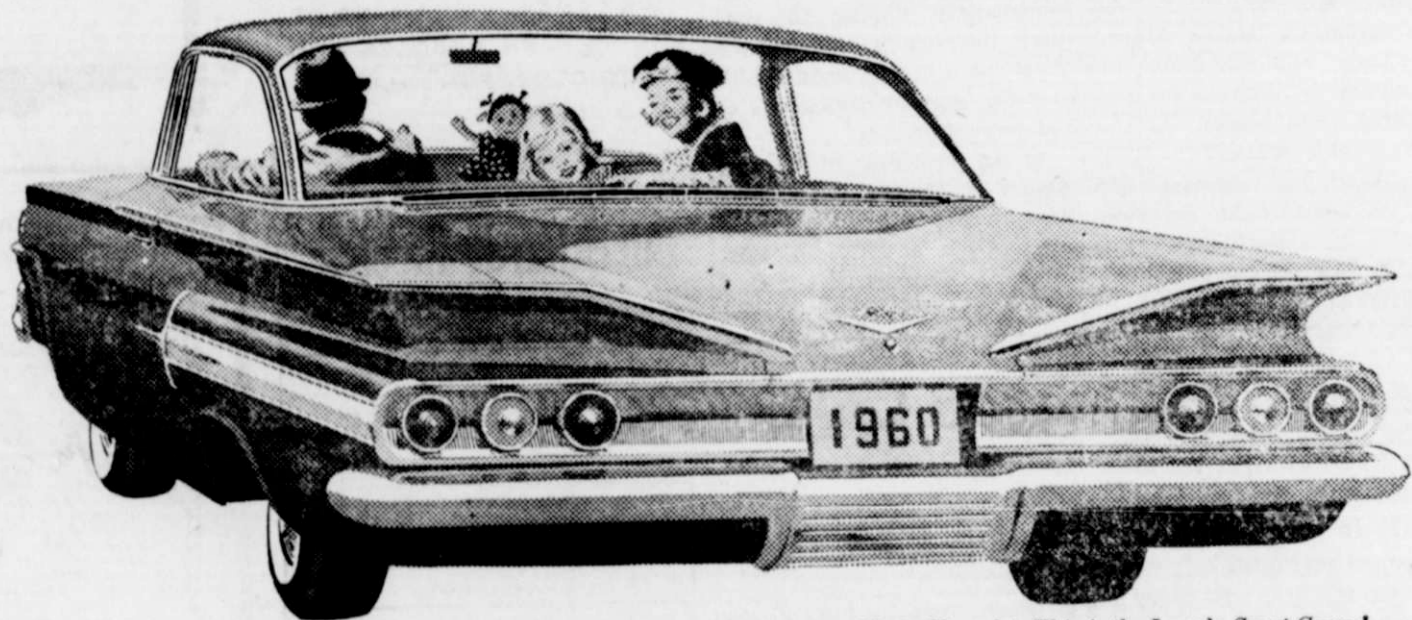
There's nothing like a new car—and no new car like a Chevrolet. This is the Impala Sport Coupe!