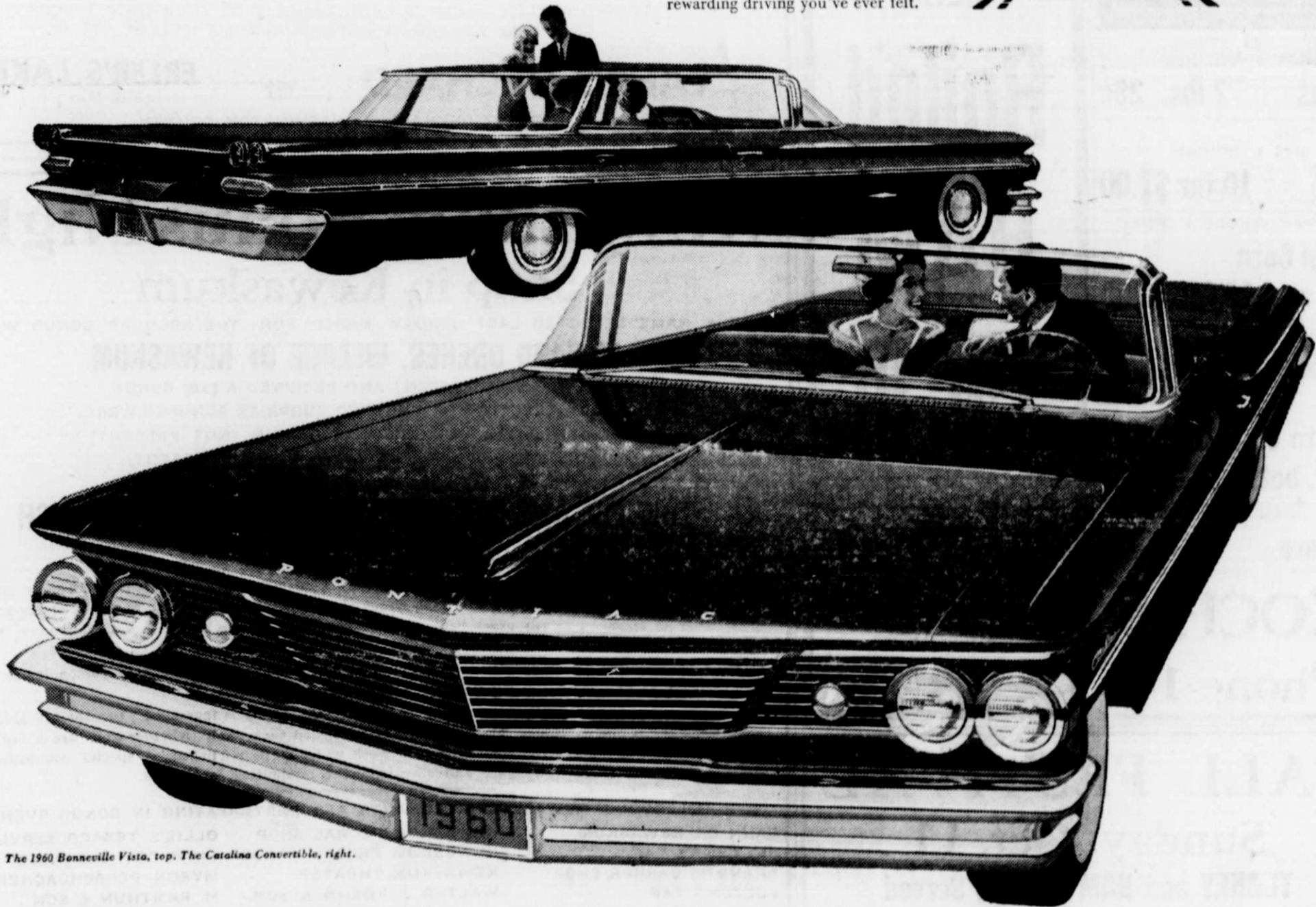
The 1960 Bonneville Vista, top. The Catalina Convertible, right.

PONTIAC THE ONLY CAR WITH WIDE-TRACK WHEELS