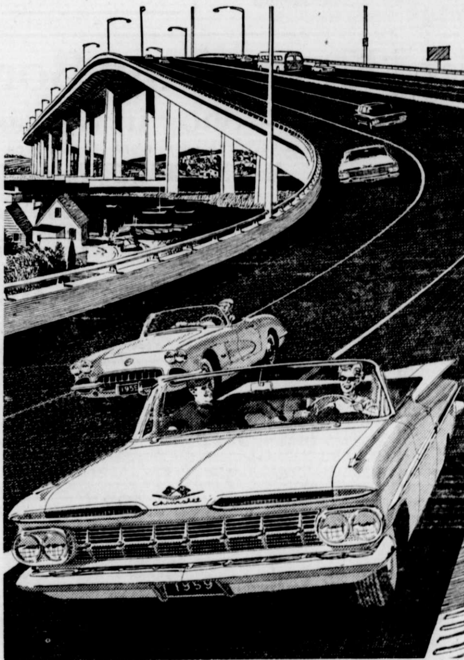
Open invitation to excitement, the Impala Convertible . . . and America's only authentic sports car, the Corvette.

One of 7 Big Bests Chevy gives you over any car in its field