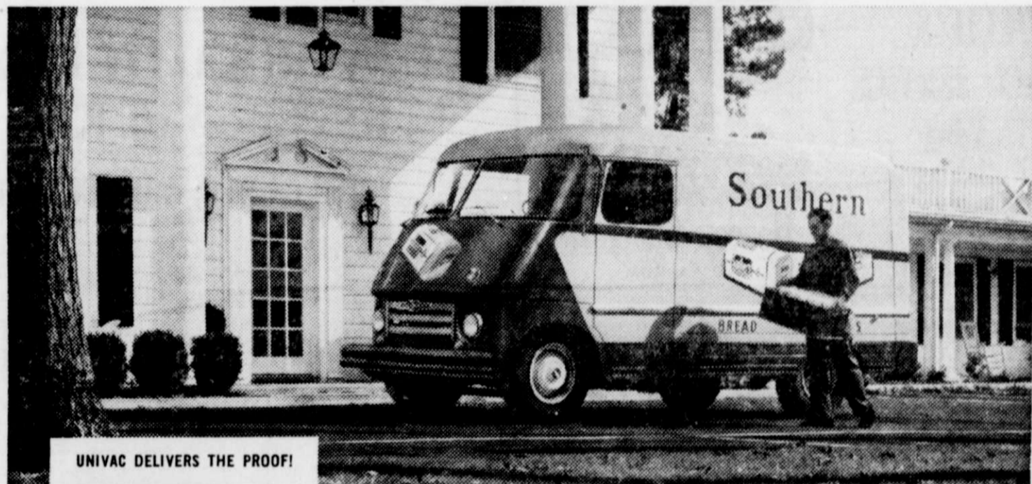
UNIVAC DELIVERS THE PROOF!