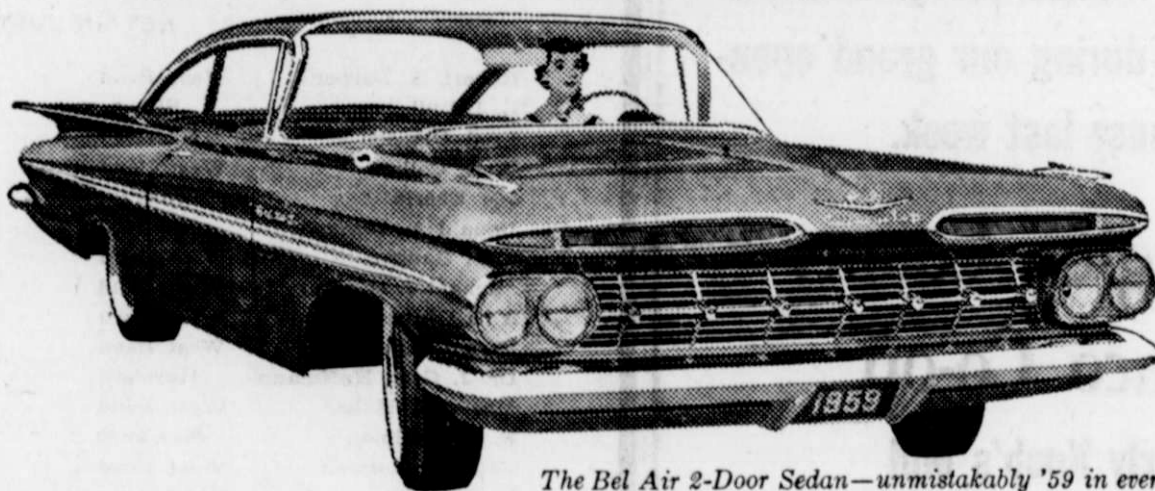
The Bel Air 2-Door Sedan—unmistakably '59 in every modern line.

SPECTACULAR DEALS NOW! SPECTACULAR SELECTION NOW! FAST APPRAISAL AND DELIVERY NOW! TRADE AND SAVE NOW!