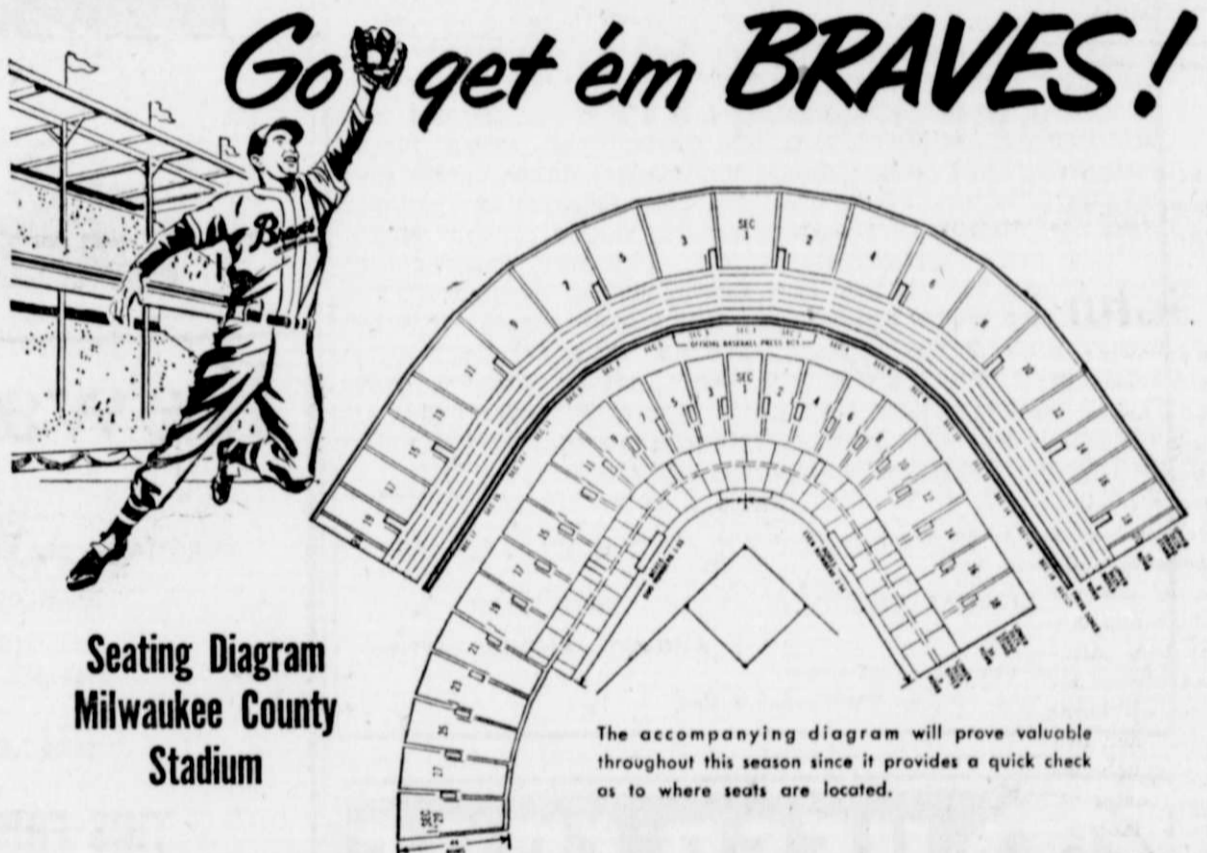
Seating Diagram Milwaukee County Stadium

The accompanying diagram will prove valuable throughout this season since it provides a quick check as to where seats are located.