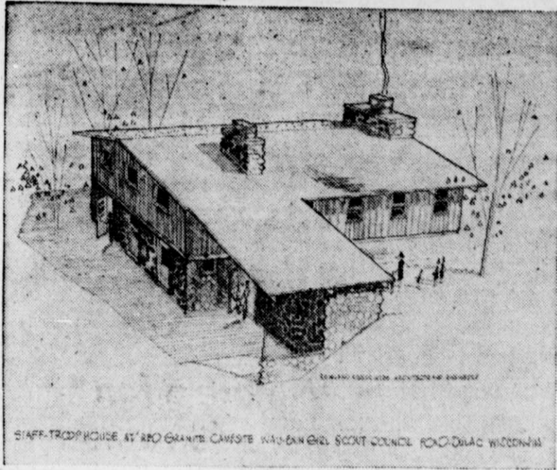
STAFF TROOP HOUSE AT 280 GRANITE CAWSPITE WAU-BUN GIRL SCOUT COUNCIL FOND DU LAC WISCONSIN

Hundreds of girls in this area will waste no time when school is dismissed on Friday, Mar. 6. This is the day when the girls of the Wau-Bun Council may begin taking orders for Girl Scout cookies.