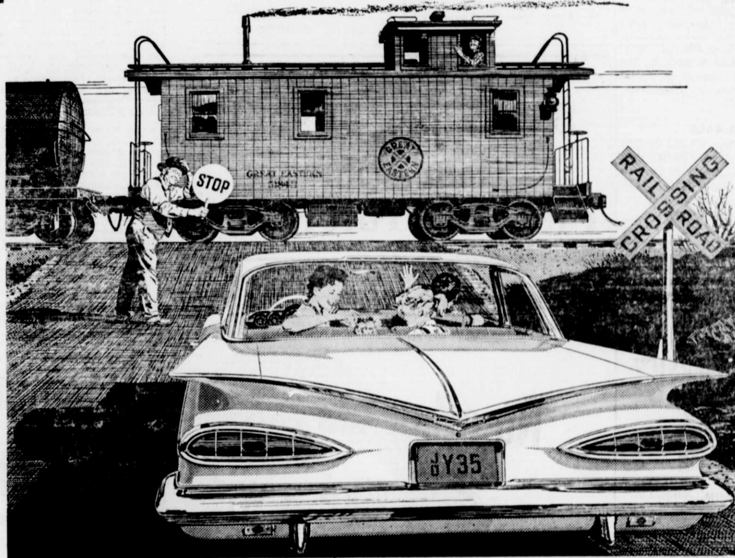
Impala Sport Coupe—like every Chevy—has Safety Plate Glass all around.