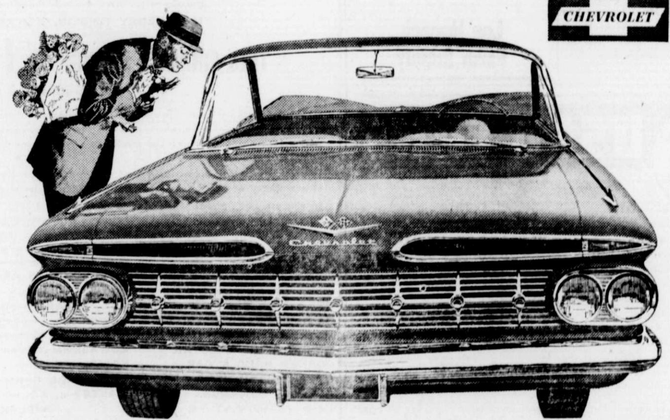
Impala Sport Coupe-with a Magic-Mirror luster that lasts and lasts.

STATION WAGONS: A choice of 5 models-2-Door or 4-6-passenger or 9 (rear-facing back seat).