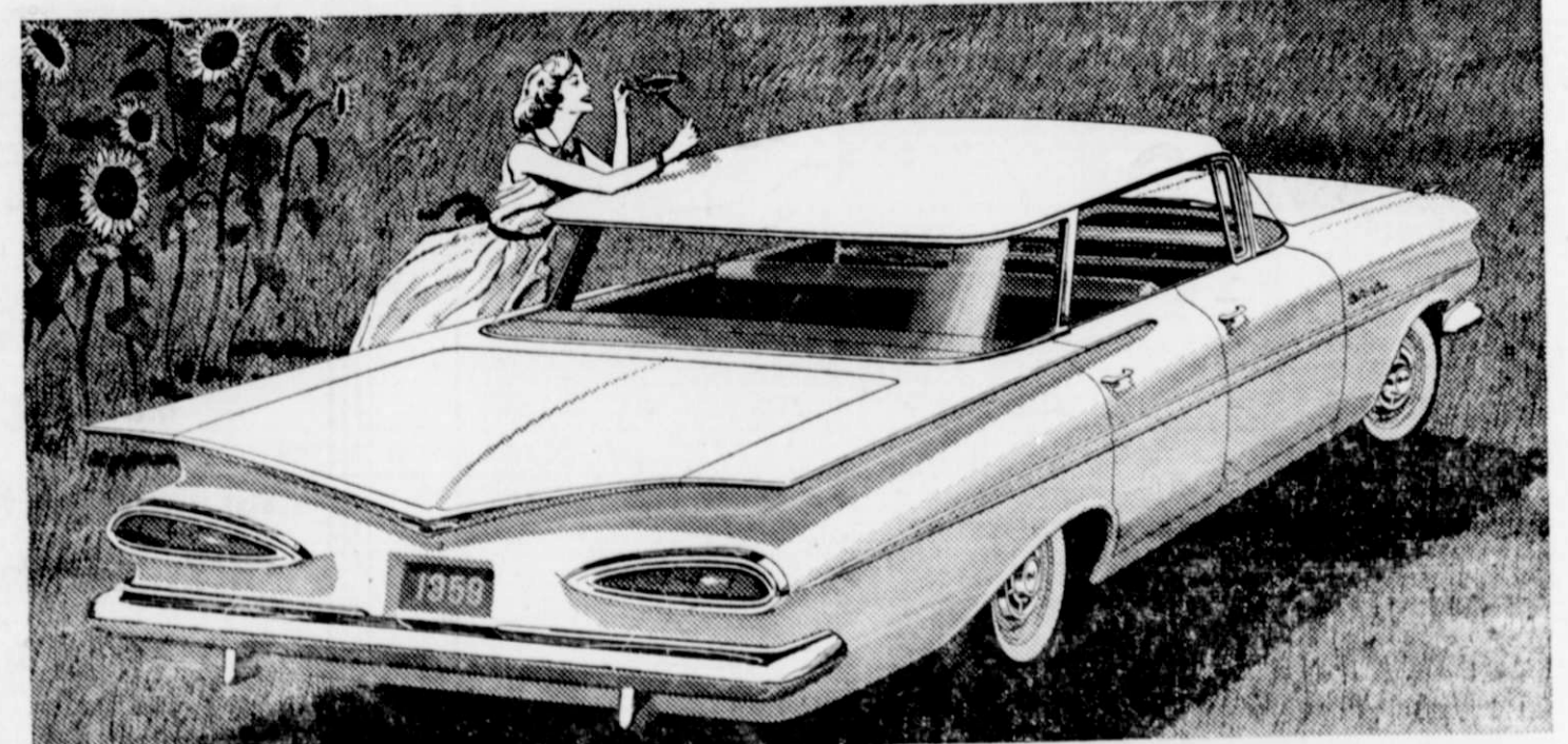
A new addition to Chevy's line-the beautiful Bel Air 4-Door Sport Sedan.

now—see the wider selection of models at your local authorized Chevrolet dealer's!