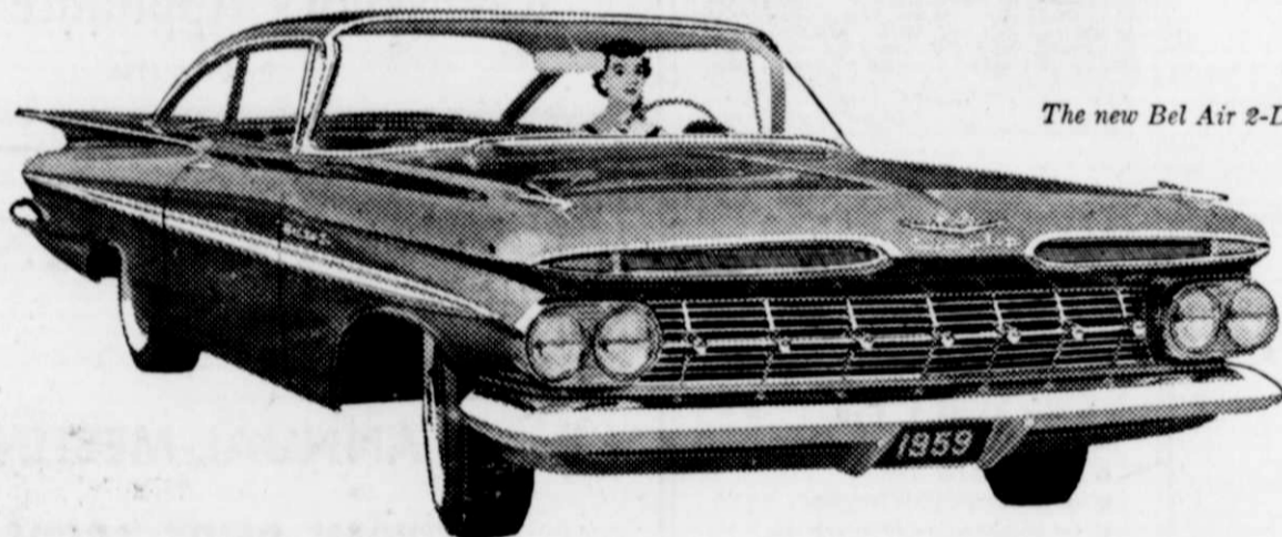
The new Bel Air 2-Door Sedan

* TOP TV—The Dinah Shore Chevy Show—Sunday—NBC-TV and the Pat Boone Chevy Showroom—weekly on ABC-TV.