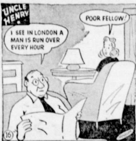
UNCLE HENRY 5021

Now! Is the time to Select a Desk, Lamp and Chair for your Boys or Girls Room VISIT