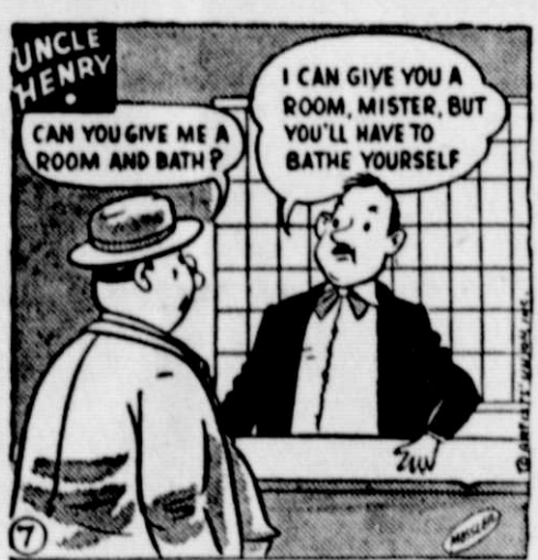
UNCLE HENRY 1022