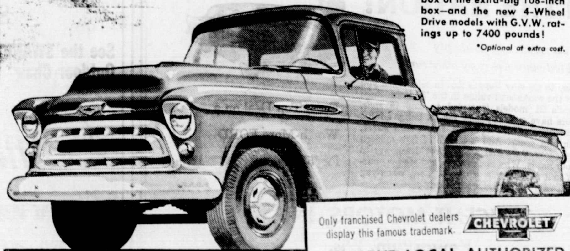
Here's the most popular pickup in America!

Only franchised Chevrolet dealers display this famous trademark.