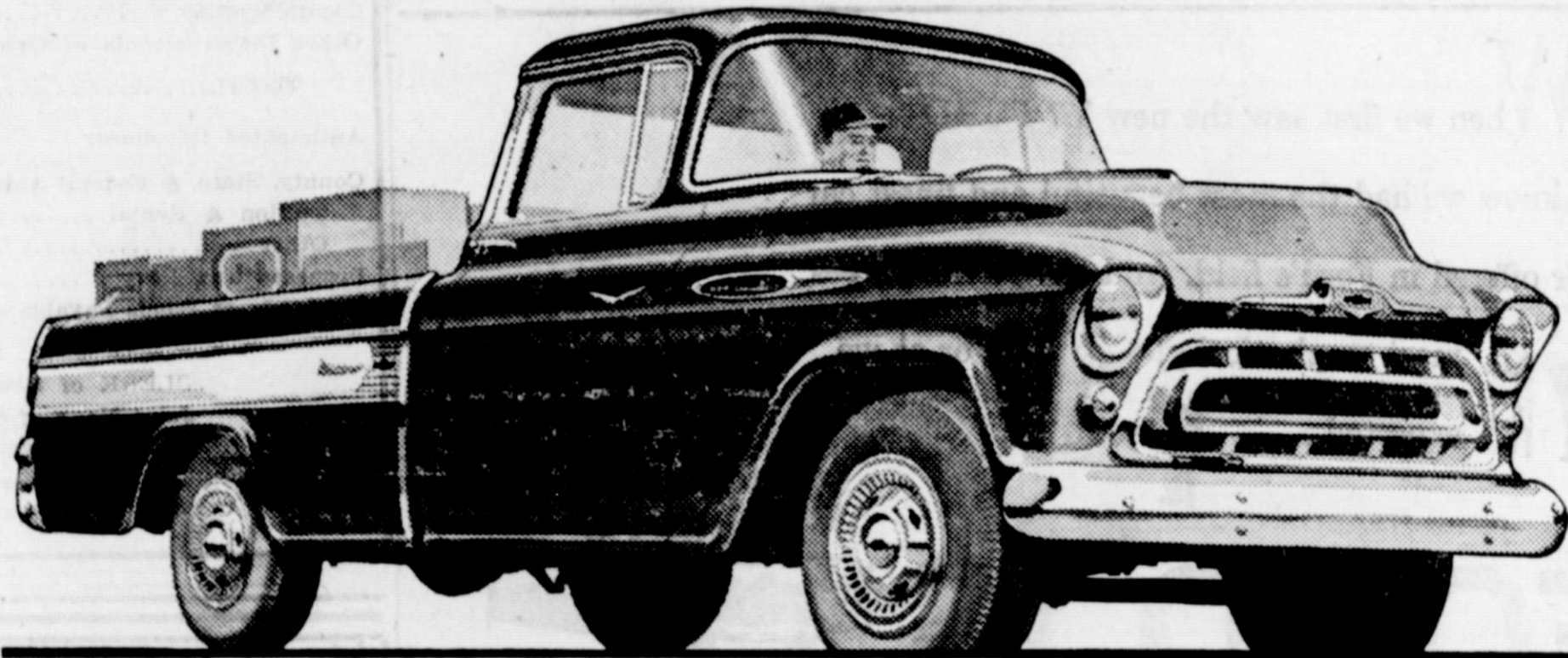
Brawny beauty that knows how to work—the high-styled Cameo Carrier!

The boys and men wish to thank the troop committee for the wonderful trip.