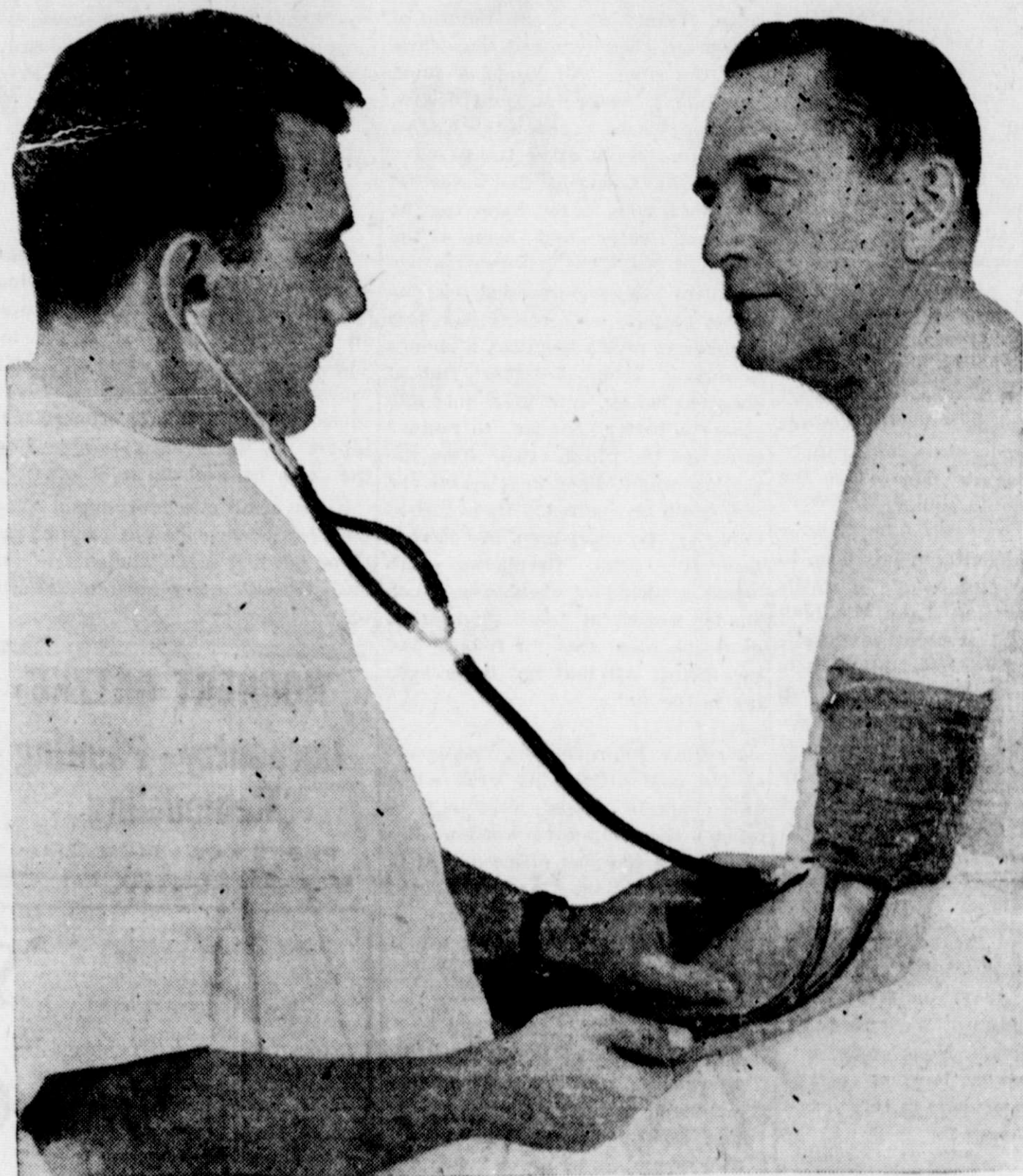
PICTURE OF A MAN INSURING HIS LIFE

Yes, this man... like hundreds of thousands of Americans... is taking out a different kind of life insurance. He has an intelligent concern about cancer and knows that early detection may mean the difference between life and death.