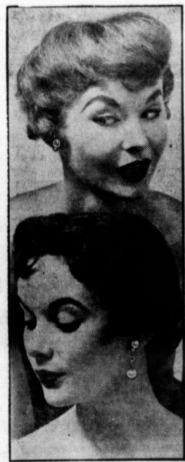
TWO-TIME? —A tiny pearl button, top, for wear with tailored daytime clothing, becomes a glamorous drop for gala occasions with the addition of a pearl-and-rhinestone "attachment," below, in La Tausca's "Two-Timer" earring.