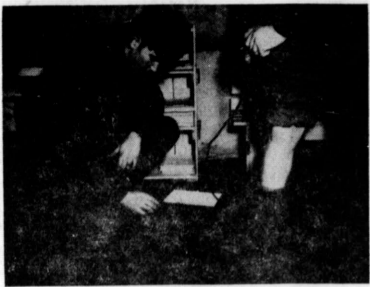
AFTER THE WADING PARTY, an Army Quartermaster test trooper checks the body temperature of one of his buddies. Such scientific experiments have made American soldiers the world's most comfortably clad and has helped them to lick a formidable enemy—the weather.