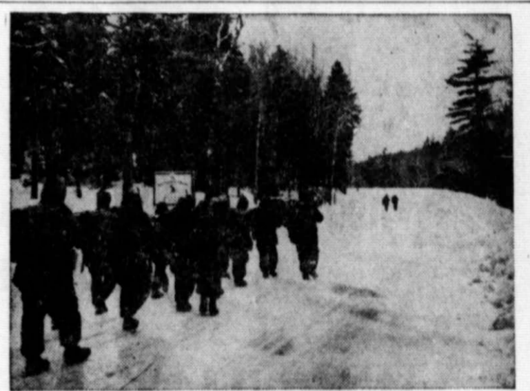
HIKES BY ARMY QUARTERMASTER TROOPS are longer on winter tests than in desert experiments. At Mount Washington, N. H., they make a ten-mile forced march with 30-pound packs to test uniforms and equipment developed by the Army Quartermaster Board at Fort Lee, Va.