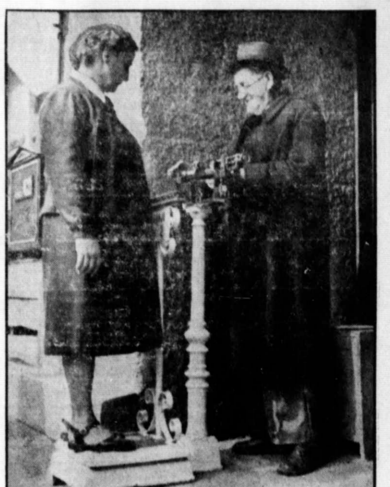
WEIGH OF ALL FLESH —A current weight-losing craze has women of Europe—East and West alike—watching their pounds. While the women lose weight, they hope, there's a man who gains from the fad. He's the one with the scales who goes to the market and weighs all who want to reduce. Scene above is in Yugoslavia.