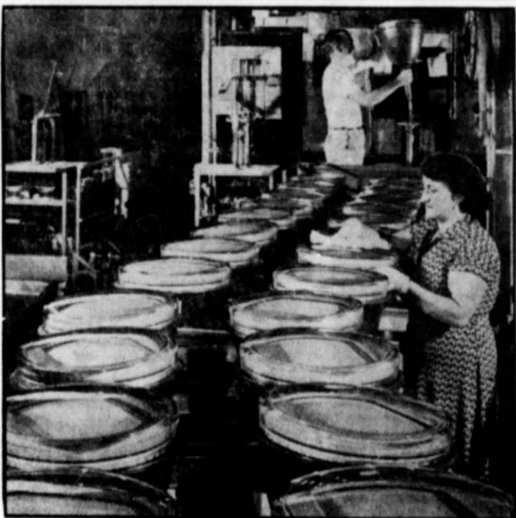
COLOR COMING—Only the go-ahead signal from Washington is needed to add color to television. Proof that color TV is just around the corner is this assembly line of color tubes at the Lancaster, Pa., RCA plant. These tubes are about to undergo an "exhausting" experience as they move toward the air-exhausting machine which creates a near-vacuum within the tubes to assure successful electronic operation.