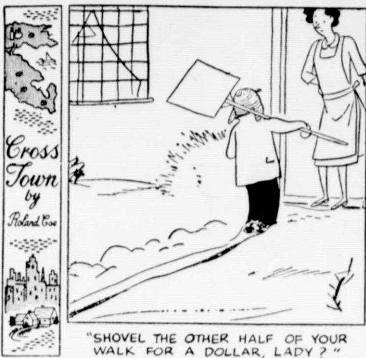
Cross Town by Roland Cox

"SHOVEL THE OTHER HALF OF YOUR WALK FOR A DOLLAR, LADY?"