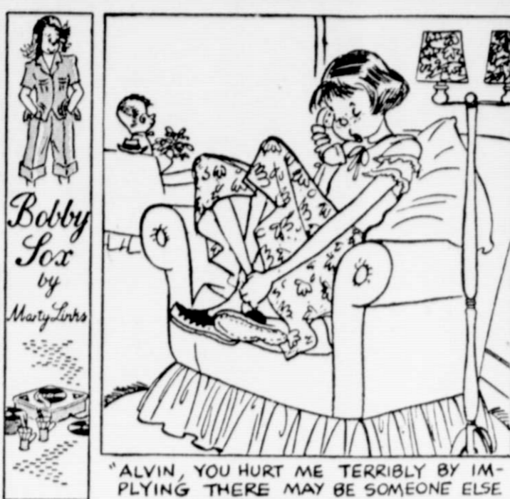
Bobby Sox by Marty Lubbo

"SHOVEL THE OTHER HALF OF YOUR WALK FOR A DOLLAR, LADY?"